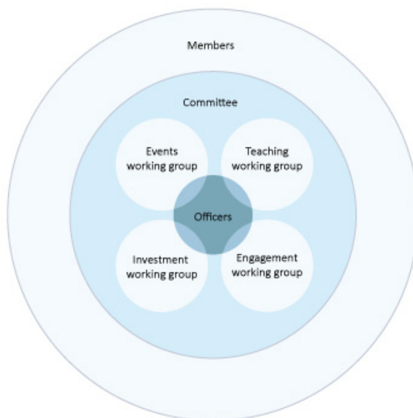
A visual interpretation of the governance structure for UACES

The Association is governed by a Committee which includes a Chair, a Secretary and a Treasurer. In addition to the Committee, there are working groups which undertake specific tasks. The student members of the Association are represented by the UACES Student Forum.