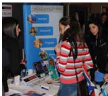
Students at the UACES stand

On Saturday 13 February UACES was represented at the annual European Voice EU Studies Fair in Brussels. The fair, which assembled over 50 universities and EU affiliated organisations, gave students the opportunity to learn about the wealth of Postgraduate Courses offered across the EU and beyond.