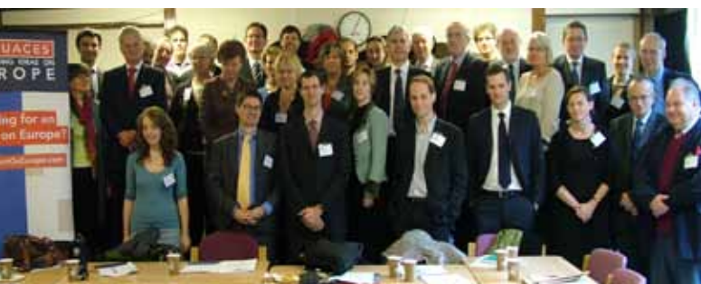
Assembled Conference Participants